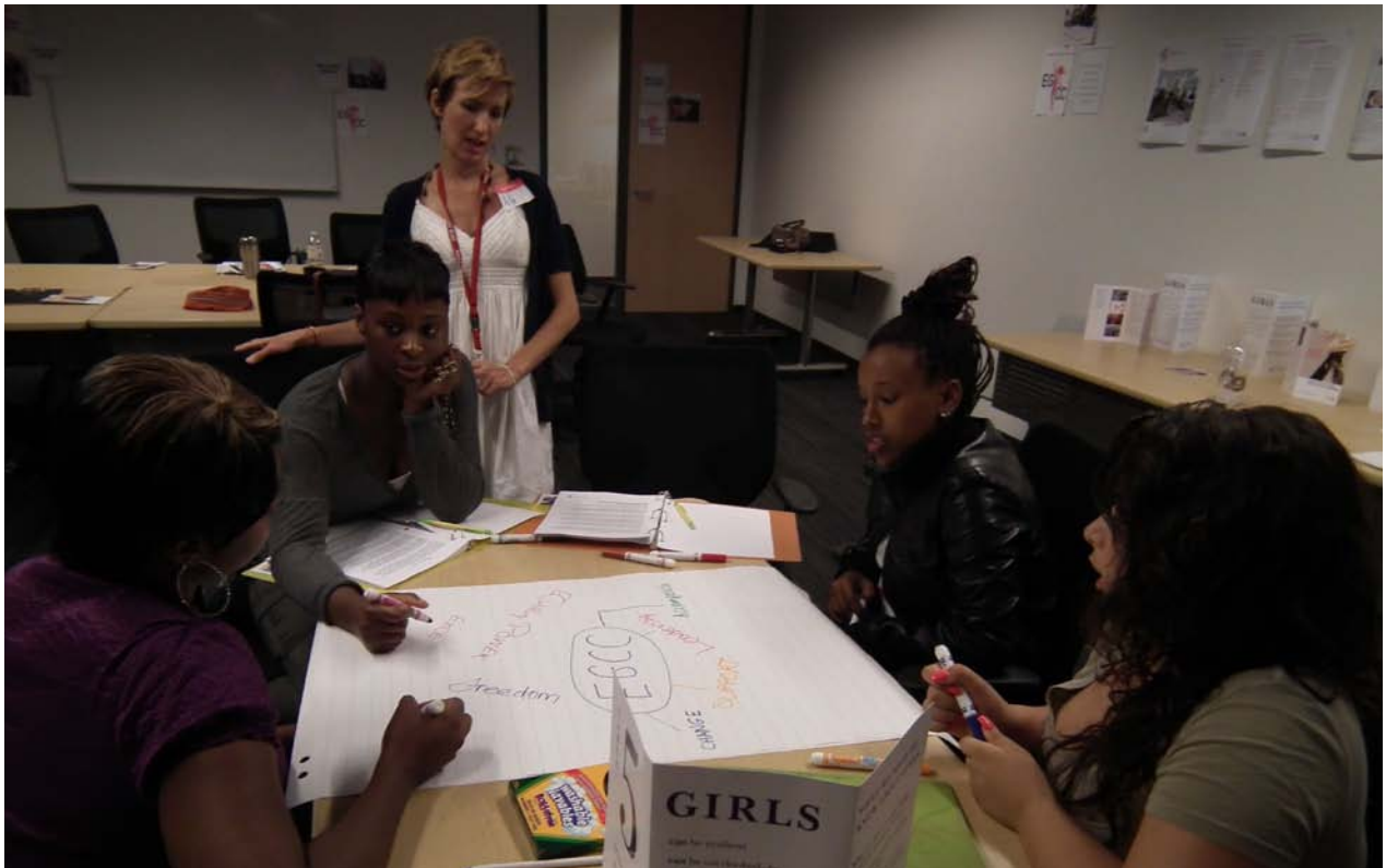
Some of the youth interns gather for a discussion

I'm excited for a project like this. It feels like people actually care about what I have to say.